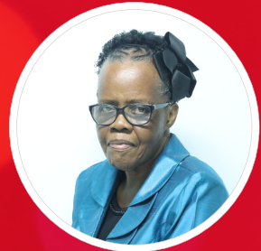
Minister Claudine Reid Merryland