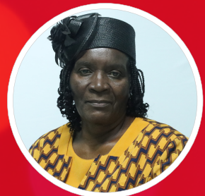
Minister Elsa Samuda Gibraltar