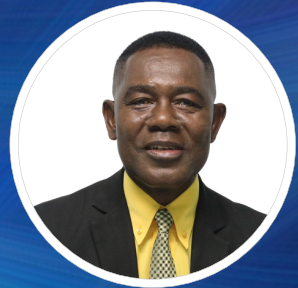
Minister Errol Moseley