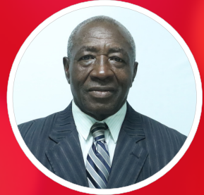
Minister Lynford Samuda Giblatore