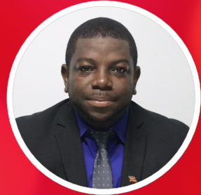
Minister Rand Davis Dover Castle