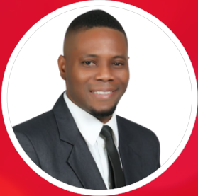
Minister Leroy Hutchinson Waterloo