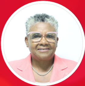
Minister Iona Campbell-Francis Long Hill