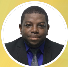
Minister Rand Davis Men's Ministry