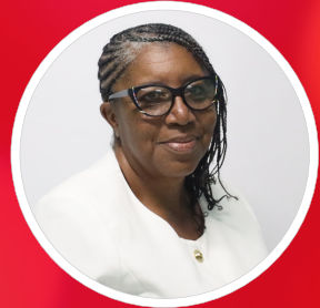
Minister Doreen Merchant Riversdale