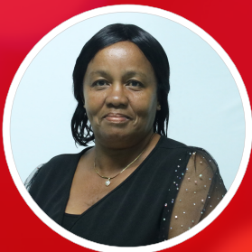
Minister Veronica Livingston St. Faiths