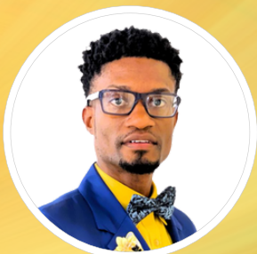
Minister Jermaine Bethune YAYA Ministry