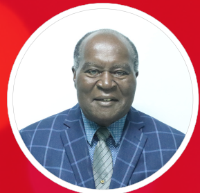
Minister Henry Wilson, J.P. Central Village