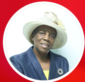
Minister Fay Samuels Frazers Content