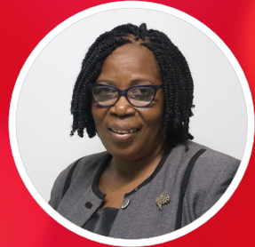
Minister Gleneth Fletcher Caymanas Bay