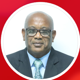
Minister Howard Facey Cross Road