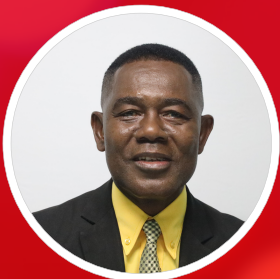
Minister Errol Moseley Linstead