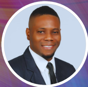
Minister Leroy Hutchinson