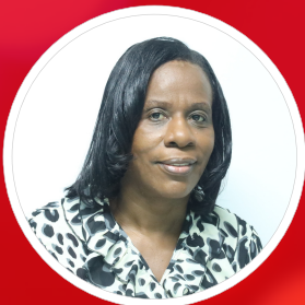
Minister Coleen Rhooms Edward Piece