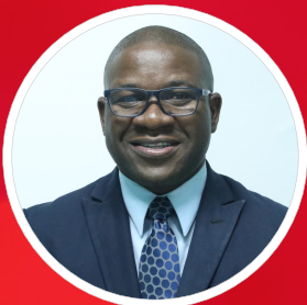
Minister Dwight Holland Centre Cut