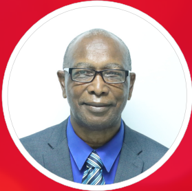
Minister Ralston Samuels Frazers Content