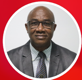
Minister Maj. Curtis Rolston, J.P. Canal, Church Road & Mullock