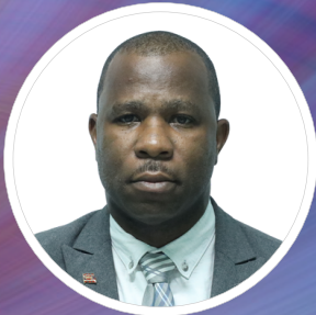
Minister Nicholas Barrett