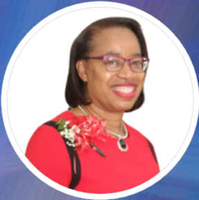
Minister Patricia Headlam